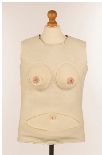
Figure 1: Demonstrating Breast Reconstruction, 2015. Textile model. 80×30×30cm.

Sissons which can be manipulated to demonstrate two different types of breast reconstruction. The model is now being used in the complex breast reconstruction clinic to demonstrate different options for surgery (Figure 1).