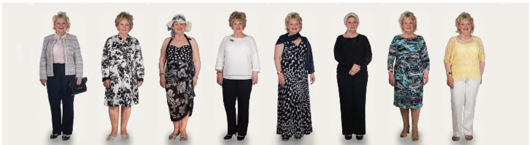
Figure 2: The Patient's Journey through Fashion, 2015.

In another activity, to enable the patient's voice to be heard widely, Thimbleby worked with a different group of the women to create ten digital patient stories (short videos) telling of their experiences from full body scans to false expectations, from relationship challenges to loss of libido. These short videos have been shown in conferences, hospital corridors and many gatherings of women.